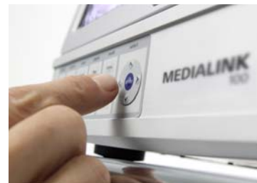
All patient images can be saved and accessed in a central folder in a matter of seconds.

"MEDIALINK 100 allows me to very quickly and easily show the treatment images to my patients."