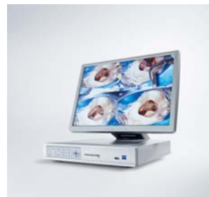
Informative images and videos for patient communication.

MEDIALINK 100 allows me to very quickly and easily show the treatment images to my patients. MEDIALINK 100 permits fast access to the patient file and the images and videos stored there.