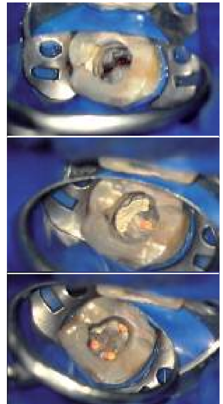
Fig. 2: Perforation sealed with mineral trioxide aggregate (MTA) during root canal treatment

During root canal treatment most procedures take place inside a tooth. Treatment is often performed with a basic knowledge of the dental pulp and x-ray findings. The dental microscope,