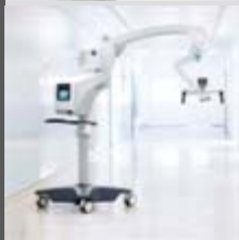
OPMI® VARIO 700