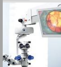
Surgical microscope OPMI® LUMERA® 700