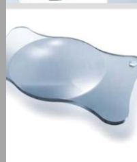
Intraocular lens AT LISA