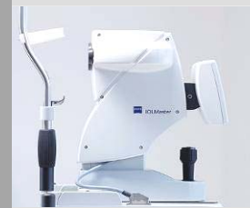
Optical biometry: IOLMaster® 500