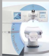
Femtosecond laser system: VisuMax®