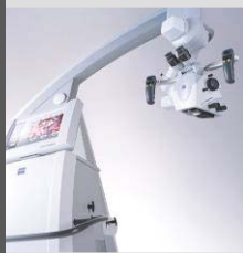
Surgical microscope PENTERO 900