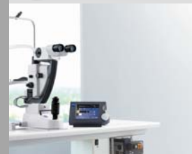
VISULAS Trion VITE