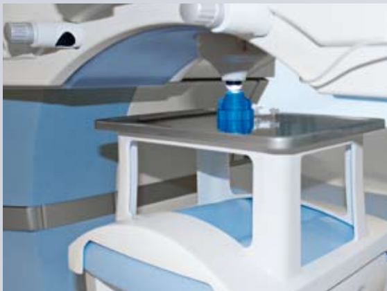
The special adapter offers surgeons a robust and sterile working platform for donor graft preparation

When combined with the new Keratoplasty option, VisuMax quickly converts into a workstation for corneal transplantations – a powerful platform with an extraordinary laser pulse rate of 500 kHz. Excellent incision quality and laser control enable fast creation of smooth lamellar and circular cut surfaces for highly precise corneal transplantations.