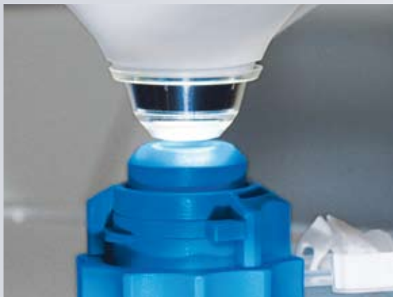
The dedicated Treatment Pack KP for donor graft preparation helps avoid unnecessary compression with its gentle suction design

Engaged in the continuous pursuit to improve corneal surgical success at the point of care.